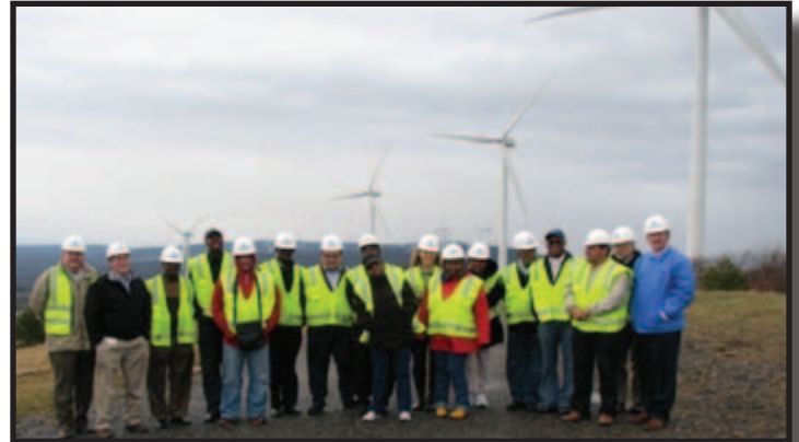
IP3's Washington, DC based trainings offer site visits to utilities, regulatory bodies, government agencies, donors and private organizations relevant to the training. Photographed is IP3's 2009 Regulating Renewable Energy training participants at a site visit to a Dominion Power Wind Farm in Grant County, West Virginia.

Although we have made great progress, there is still much to accomplish, and large capacity building efforts are still required. IP3 has once again risen to the challenge. We are pleased to provide you with our new 2010 Training schedule that offers an array of new and updated courses, new delivery methods (one-week courses and self-paced online courses), and a new training location.